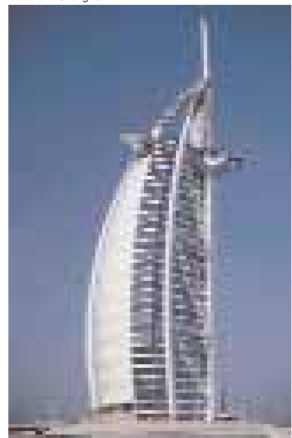
The world's only six-star hotel can be found in Dubai.