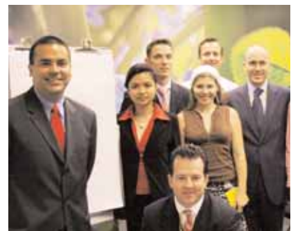
Hult students are already taking advantage of the elective module in Shanghai.