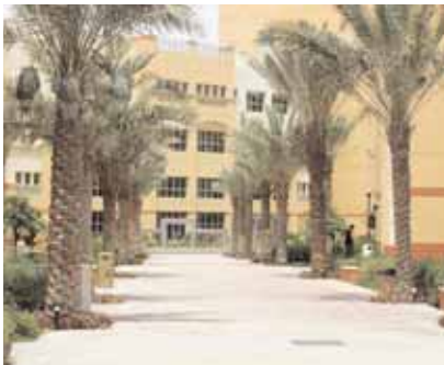
Hult Dubai is accepting students for September 2008

The momentum is accelerating. Hult is rapidly becoming a truly global business school.