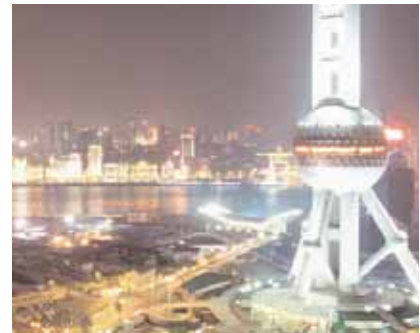
Shanghai offers students a first-hand look at the Chinese economy.

The expansion into China and the Middle East will add depth and breadth to the Hult MBA experience. By transforming the Hult program into a truly global MBA, it will go far to enhance the Hult brand and add value to the Hult MBA.