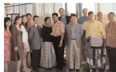
The class of 1982 join together in Boston and share their experiences over the past 25 years.